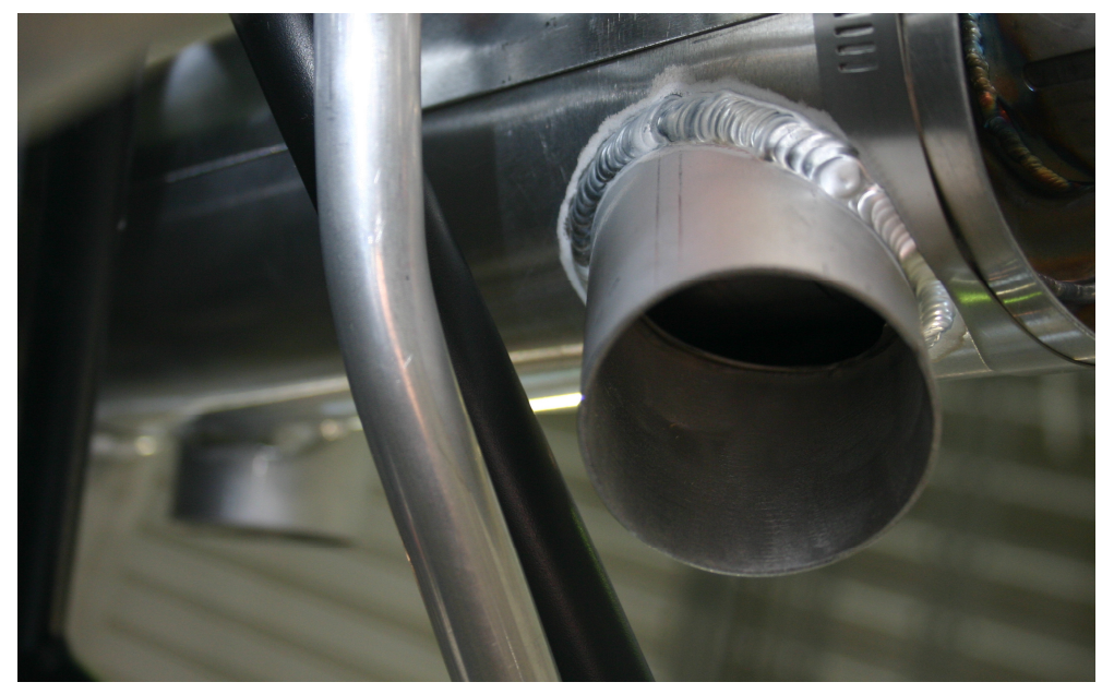
FIGURE 2 – Close View of Clearance Required

Cub Crafters, Inc. Considers Compliance Mandatory August 25, 2009 The parts of this Service Bulletin that change the Type Design of the aircraft have been approved by the FAA.