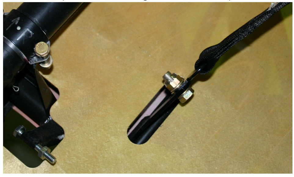
FIGURE 2 – Pilot Right Side Lap Belt Attachment (Castle Nut & Cotter Pin, Nut Facing Aircraft Centerline)